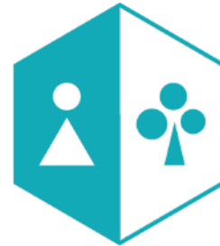
Society and innovation