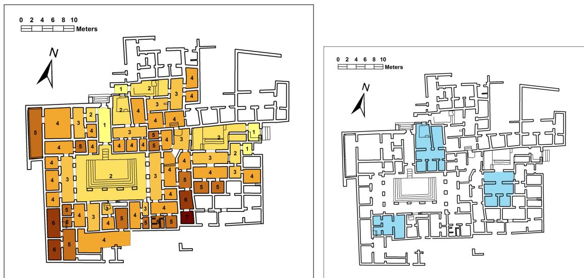
Figure 3: The palace complex at Songo Mnara, Tanzania. The picture on the left shows the access analysis represented in numbers and colours. The picture on the right shows the integration of small 'house-like' units into the palace structure.