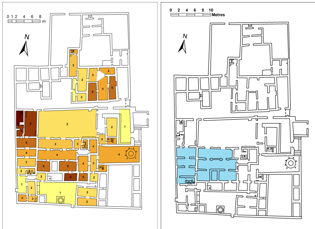
Figure 2: The palace complex at Gede, Kenya. The picture on the left shows the access analysis represented in numbers and colours. The picture on the right shows the integration of small 'house-like' units into the palace structure.