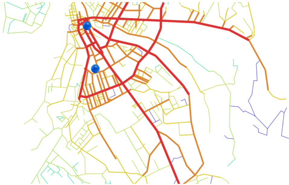
Figure 1: Graph of Integration values for the whole city of Nowy Sacz, Poland. Blue dots indicate both problem areas discussed in the text and their location against the background of the city structure. By author.

Over the past decade, urban planning competitions have been announced for these two areas. The competition proposals made it possible to implement a range of data variables and examine the analysis results in individual iterations after their input.